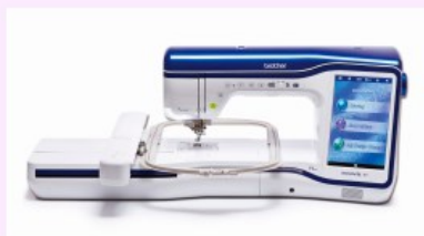
15A BLYBURGATE, BECCLES SUFFOLK NR34 9TB

Appointed Dealer for BROTHER, JANOME, JUKI, PFAFF