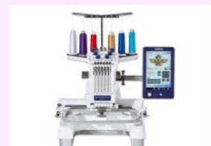
TEL: 01502 714234 WWW.BECCLESSEWING.CO.UK